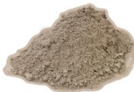
Figure 1 Pictures of the Combimix floor screed compound products and example of bulk delivery of the product in powdered form.